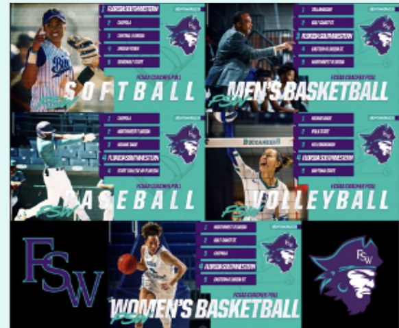
ALL 5 FSW teams are ranked in the top 5 of the FCSAA Coaches poll. Go Bucs!

After a highly anticipated wait, the Bucs kicked off their 2021 Athletic seasons this week. The Men's and Women's Basketball teams both opened their seasons in Suncoast Arena Wednesday night with victories over Hillsborough. The Baseball and Volleyball teams kick off their seasons with home tournaments this week at the Arena and at City of Palms Park. The Bucs Softball team, was recently ranked the #1 team in the country, will get their season going next Saturday in Clearwater.