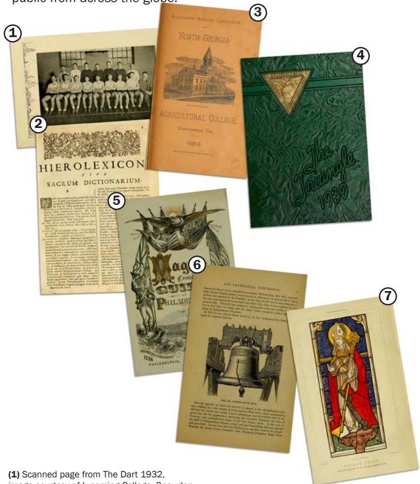
(1) Scanned page from The Dart 1932

Your valuable content is hosted, preserved, and available in multiple formats through a partnership with the Internet Archive. With a comprehensive and user-friendly interface, the Archive lets you share your library's collections with historians, researchers, and the general public from across the globe.