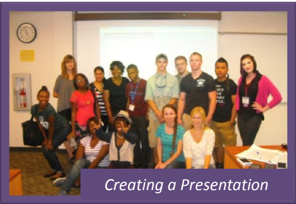
Creating a Presentation