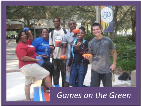
Games on the Green

FYE Programming promotes campus engagement through a variety of events and opportunities geared toward the interests and needs of first-year students, including: academic support and technology focused workshops, social engagement activities, and service opportunities.