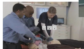
Skills & Procedures