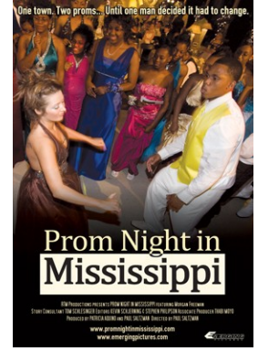
Creating a historic movement in a small town.